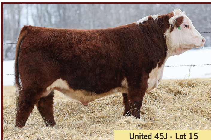
United 45J - Lot 15