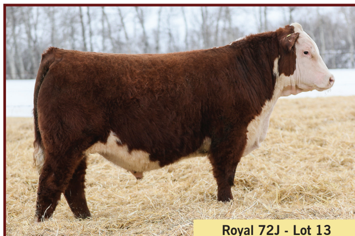
Royal 72J - Lot 13

Here is another Royal bull with that extra middle and shape. His mother is a powerful high performing Tahoe daughter.