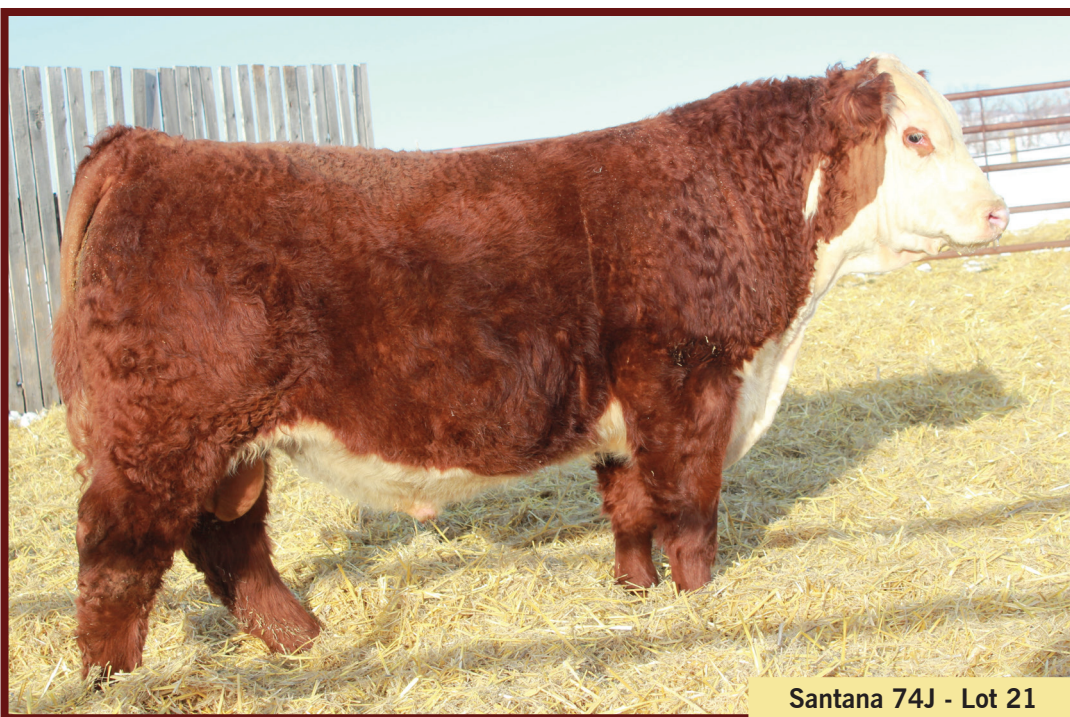
Santana 74J - Lot 21

Santana 74J is a definite fan favorite at Blair Athol. Lots of middle and muscle shape, and a Herd Bull look through his head. His Dam, 142D, is a great young cow with the kind of udder you'd like to see on every cow you own. You won't miss him sale day, make sure the staff doesn't miss your bid!!