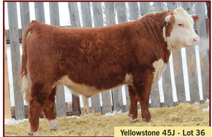
Yellowstone 45J - Lot 36