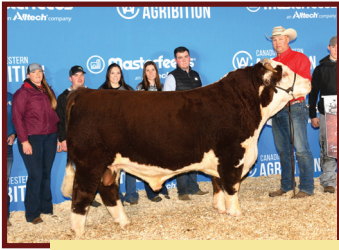
DVL 107H - Maternal Brother