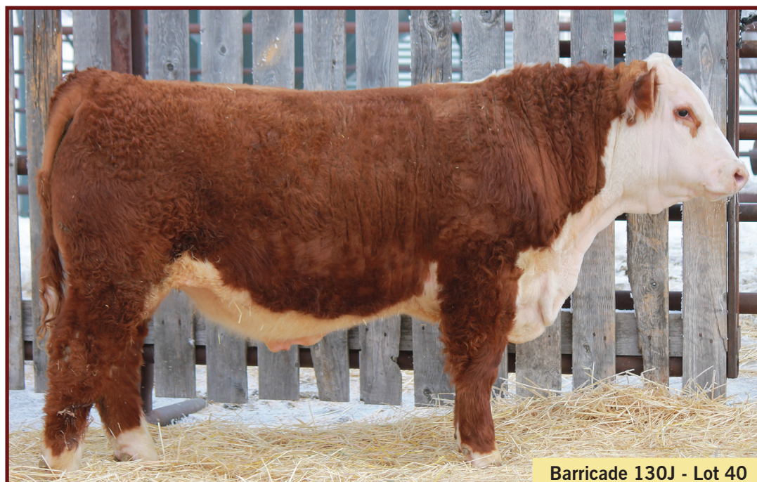
Barricade 130J - Lot 40