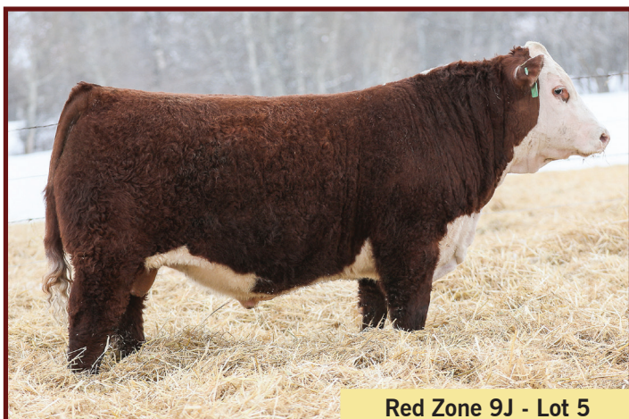
Red Zone 9J - Lot 5