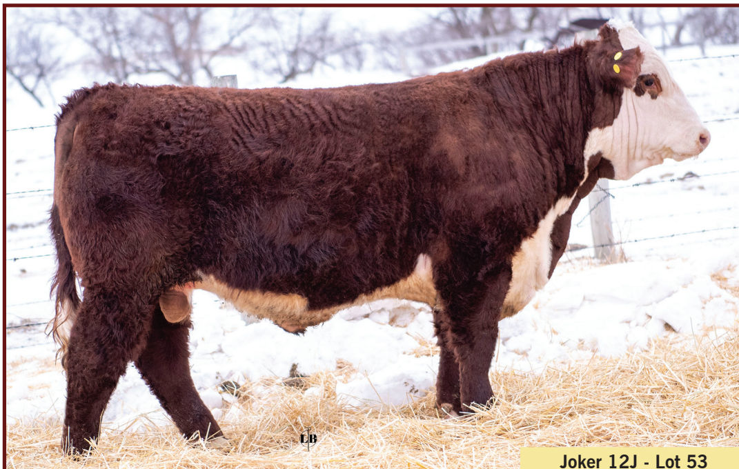
Joker 12J - Lot 53

Dark coloured. Fully pigmented and goggle eyed. Super eye appealing. Clean fronted with a nice smooth shoulder. Long sided. Great cow from the Wascana dispersal, she's broody made and big topped.