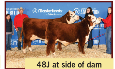
48J at side of dam