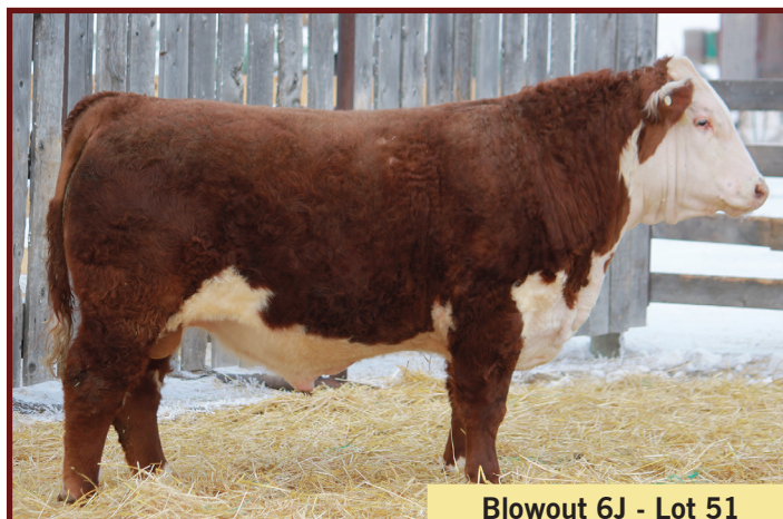
Blowout 6J - Lot 51