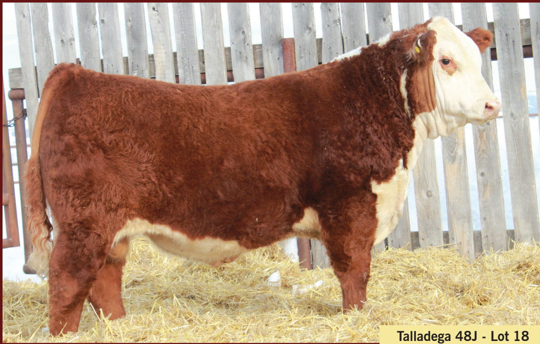
Talladega 48J - Lot 18