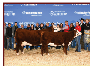
Reva 32F - Maternal Sister

A real genetic opportunity here! This is the maternal brother to our 2021 Agribition Champion Female and Miss World Champion Female!!