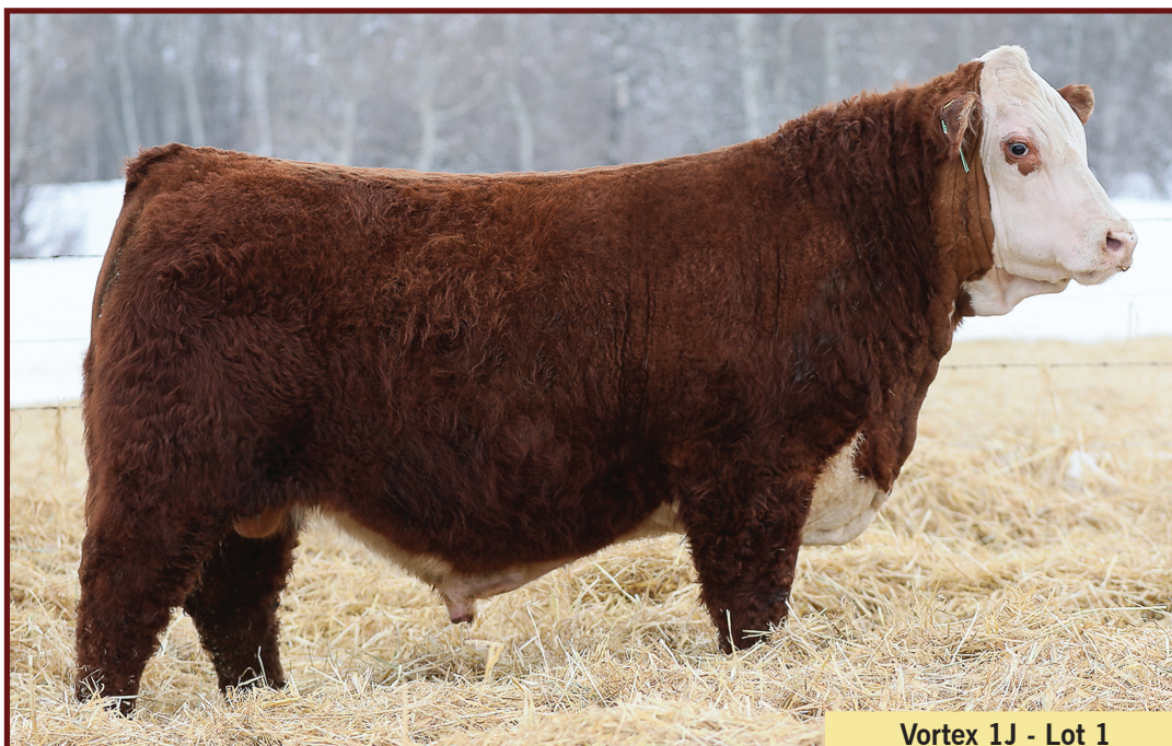
Vortex 1J - Lot 1

This Vortex son is a very high performing individual with a lot of mass and substance. Lots of hair and extra pigment on this bull. He will add pounds to your calf crop.