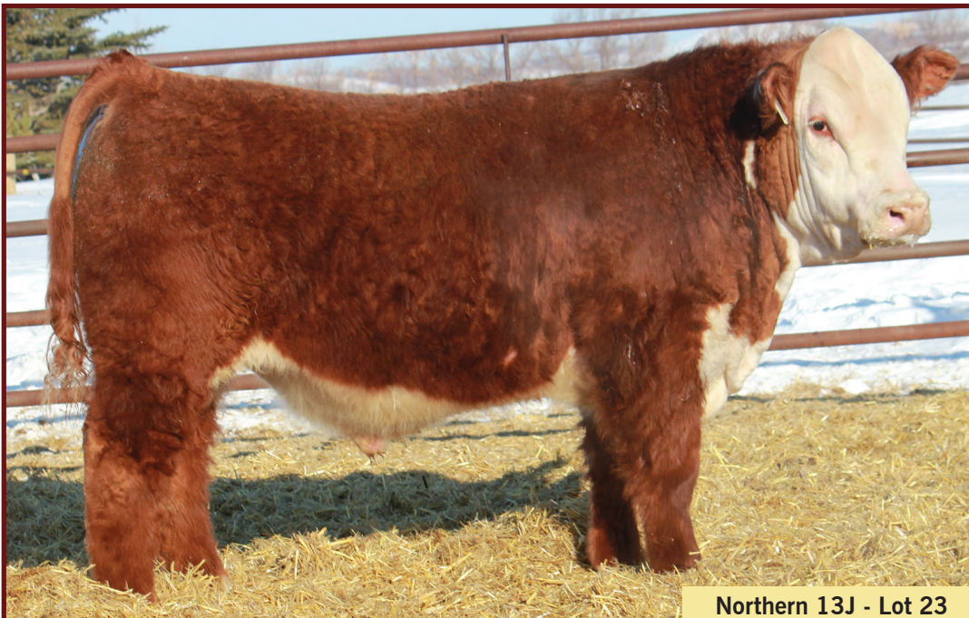
Northern 13J - Lot 23

SHF TAHOE R117 T100 HAROLDSON'S 37H MIRA ET 62K BLAIR-ATHOL 20X JAZZ ET 26Y HAROLDSON'S MARTINE 45P 22X