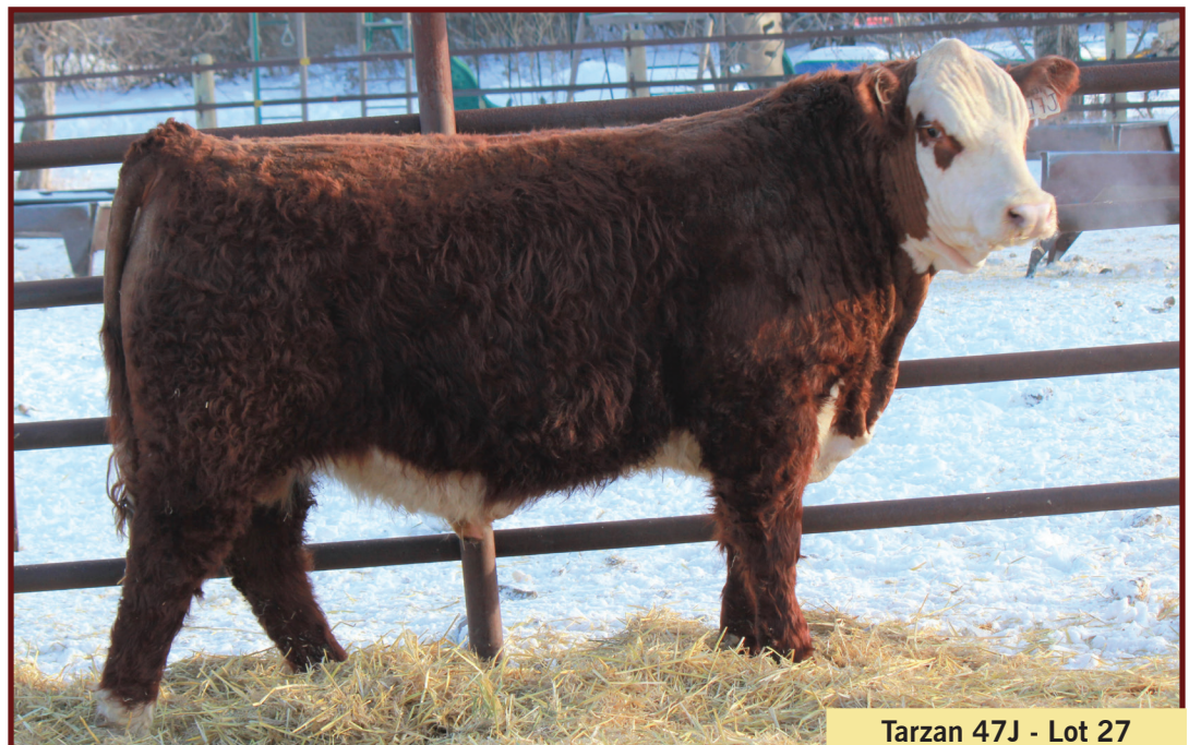
Tarzan 47J - Lot 27