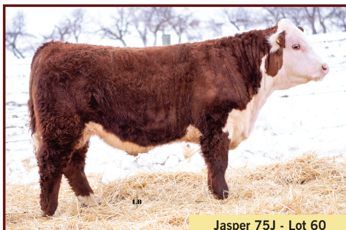
Jasper 75J - Lot 60