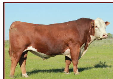
McCoy 53A Patent 124E - Sire of lots 19 -23 and the Grandsire to lot 18