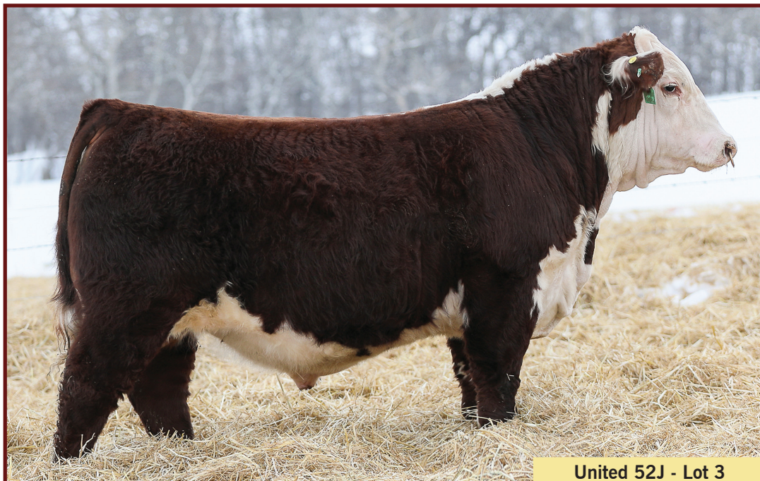
United 52J - Lot 3