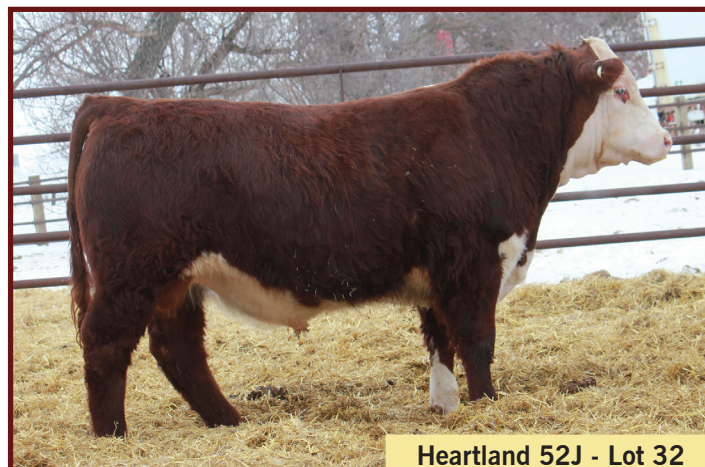
Heartland 52J - Lot 32