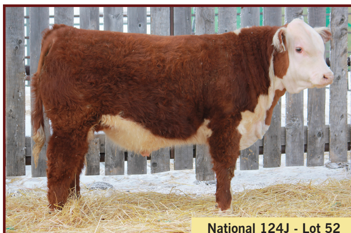
National 124J - Lot 52