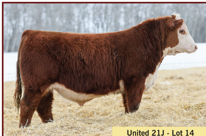
United 21J - Lot 14

This United son is very long bodied with some extra growth. He has great cosmetics and will definitely add some hair to his offspring. Extra calving ease with this individual.