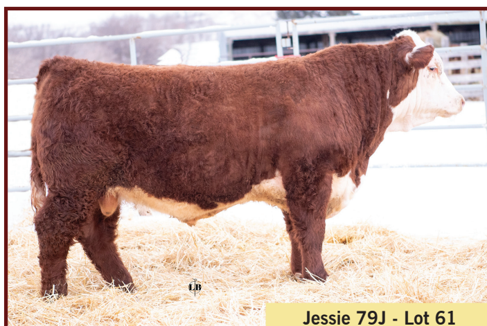
Jessie 79J - Lot 61

79J is a dark marked, red necked, red to the ground bull out of our Victoria 882F cow we purchased out of the Wascana dispersal sale. He is a moderate frame, nicely put together package. Being sired by a Stroker son is an added bonus. He is sure to produce highly maternal replacement females.