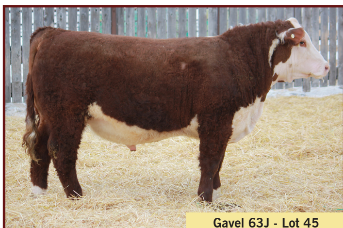
Gavel 63J - Lot 45