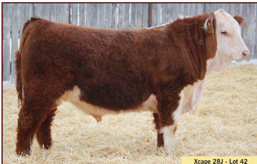
Xscape 28J - Lot 42

Out of a flawless uddered Diablo Daughter. Tons of rib and performance yet carries a nice birthweight. Full sister is in production at Golden Oak Livestock, Olds, Alta.