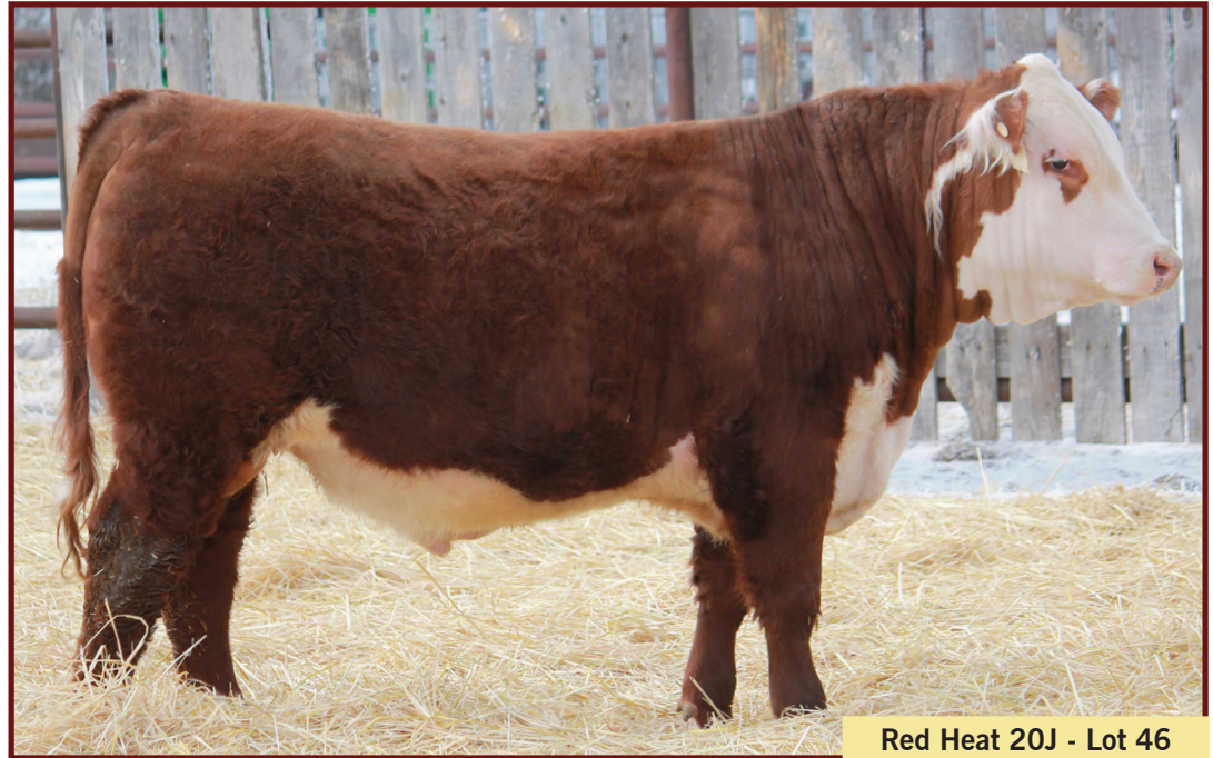
Red Heat 20J - Lot 46