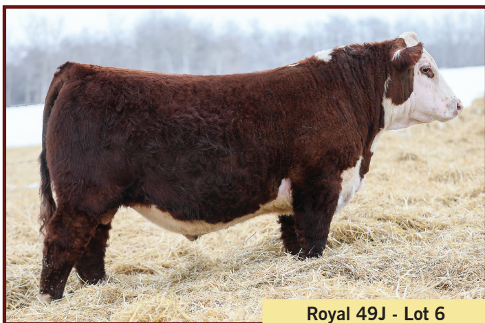
Royal 49J - Lot 6

Here is a real complete made Redzone son. He's got the length and style, yet does not disappoint when you get behind him. His mother is a beautiful young cow and really did a great job on this guy.