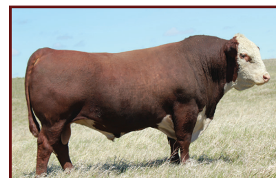
RU BA 11X Excaliber 223F - Sire of lots 24 - 27