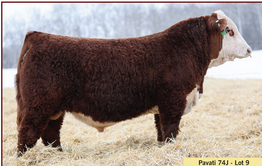
Pavati 74J - Lot 9

I really like this red necked, red eyed Pavati son. He is a real stout made individual with lots of middle and depth of flank. He's big butted and looks like a herd bull.