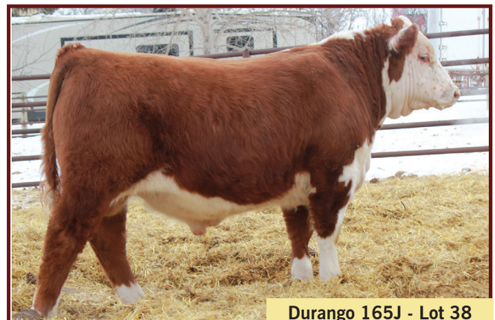
Durango 165J - Lot 38