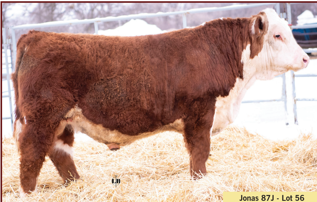
Jonas 87J - Lot 56

REMITALL KEYNOTE 20X RU 10A ELM 57E DUSTY-DEE P183 DUALY 36A SQUARE-D SUSIE 662Y