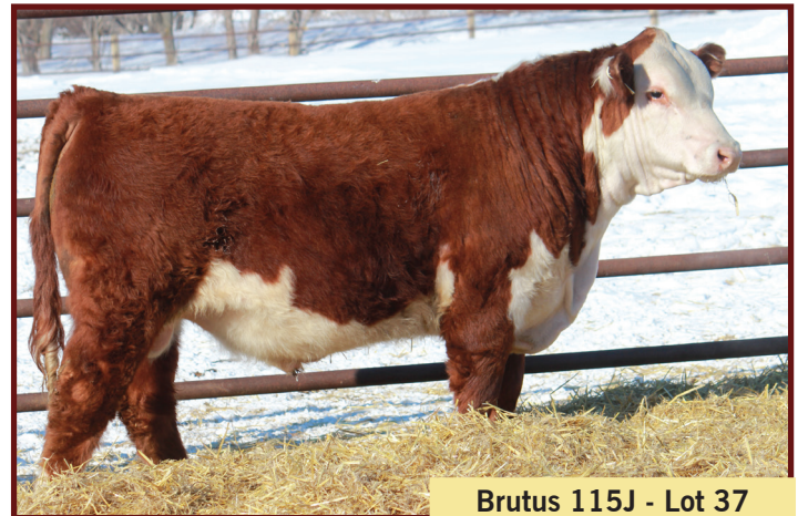
Brutus 115J - Lot 37