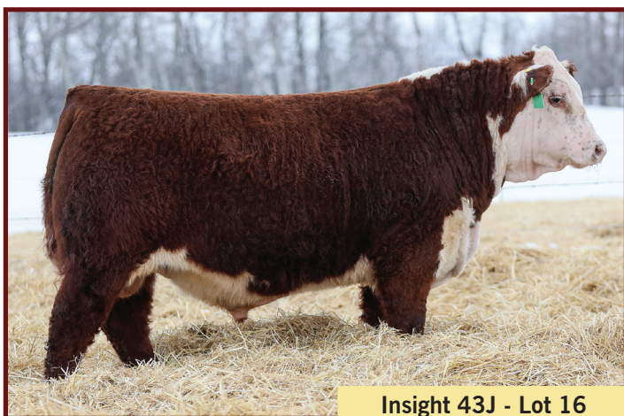
Insight 43J - Lot 16

This United son is real big middled and deep sided. His mother is a typical Tahoe daughter, sound and good uddered.