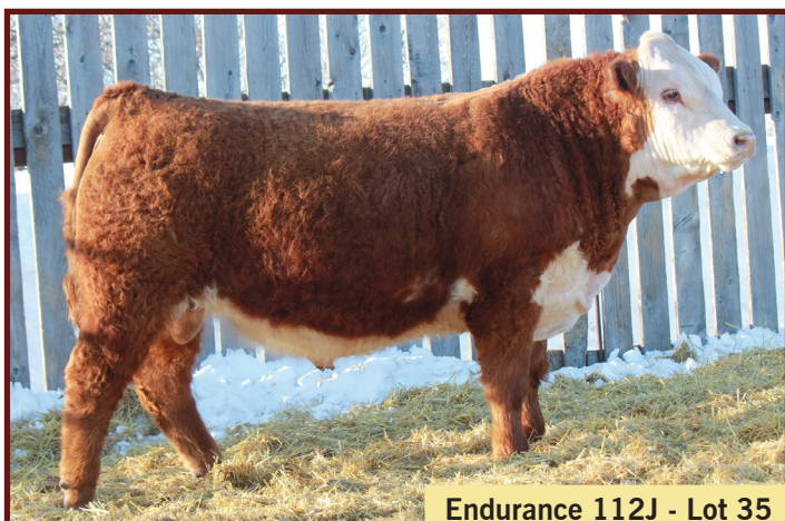
Endurance 112J - Lot 35