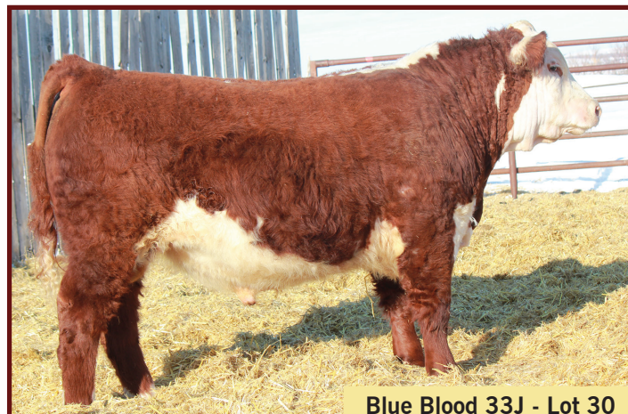
Blue Blood 33J - Lot 30