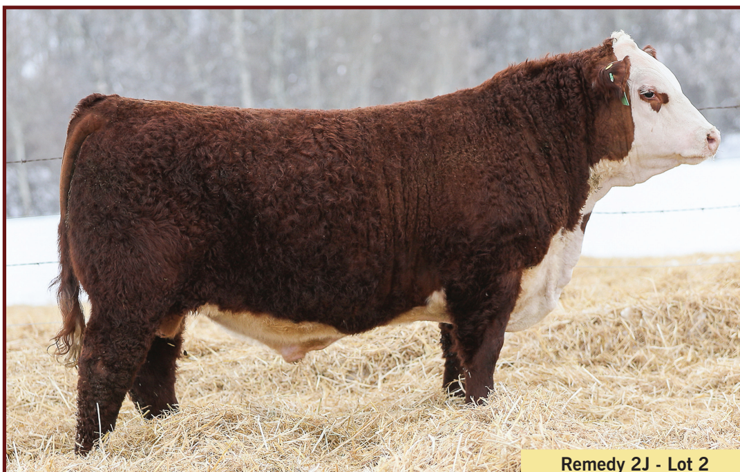
Remedy 2J - Lot 2

CHURCHILL RED BULL 200Z BLAIR'S NELLIE R117 ET 5B MHPH 521X ACTION 106A JJPH 512R 83T KOVI 116Y