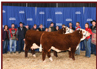
Cameo Girl - Dam