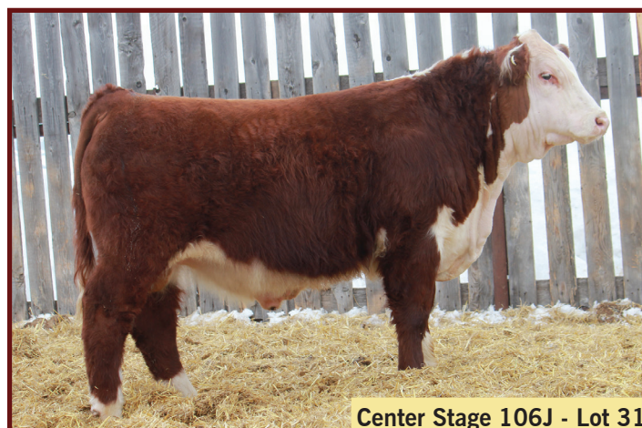
Center Stage 106J - Lot 31