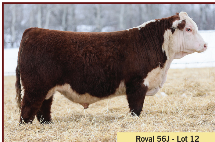
Royal 56J - Lot 12

A really complete made Royal son. He's an easy doing bull with a big back and lots of shape from behind. Royal has been doing a tremendous job siring both sexes. Loads of maternal strength here.