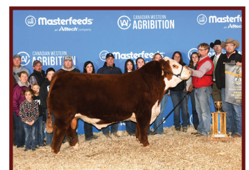
Game On 69H - Maternal Brother