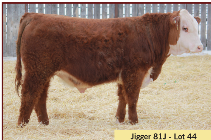
Jigger 81J - Lot 44