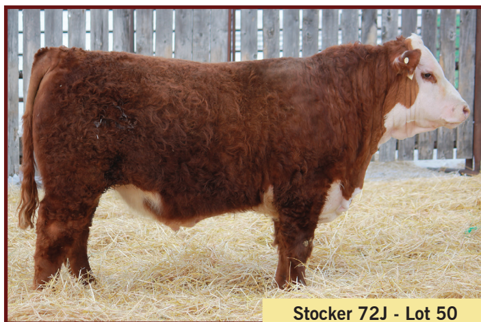
Stocker 72J - Lot 50