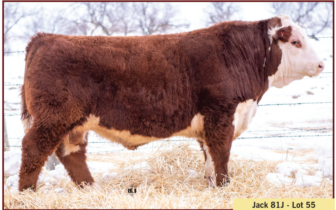
Jack 81J - Lot 55

"DEEP" is the first word that comes to mind. He is a rugged made, wide-based, deep bodied, haired up powerhouse. Remitall Belmont on the top side and going back to the old RU Galaxy on the bottom this guy is sure to add pounds and performance.