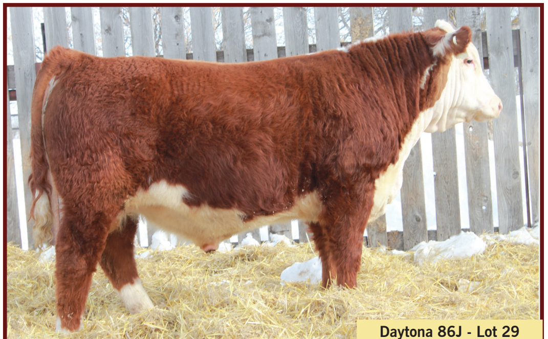
Daytona 86J - Lot 29