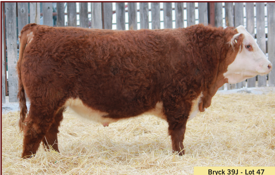
Bryck 39J - Lot 47

TH 122 71I VICTOR 719T TH 7N 45P RITA 71U SQUARE-D TUSCON 362T CLAYRIDGE ELSIE 42U