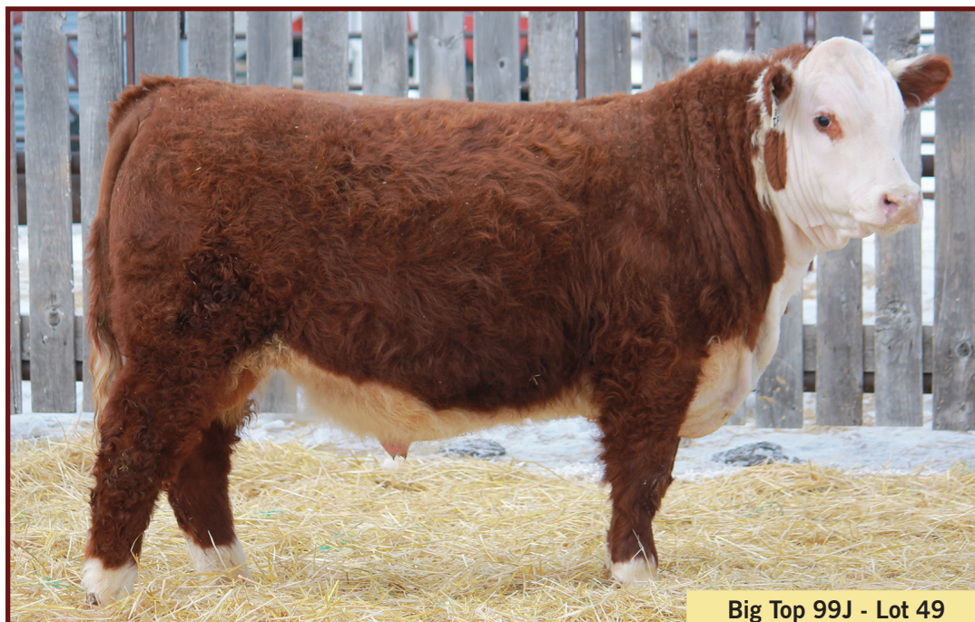
Big Top 99J - Lot 49

An interesting calf that is complete made and is definitely a calving ease option. He boasts an excellent set of numbers! Out of a first calver that was bred by Dorbay that did an excellent job.