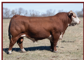
Humbolt 1F - Sire