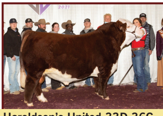
Haroldson's United 33D 36G Sire of lots 28 - 32

TH 122 71I VICTOR 719T BBSF 52U FAWN 22X BLAIR-ATHOL 60D WESTERN 25L FJELLEBRO 4E APPROVAL 740J