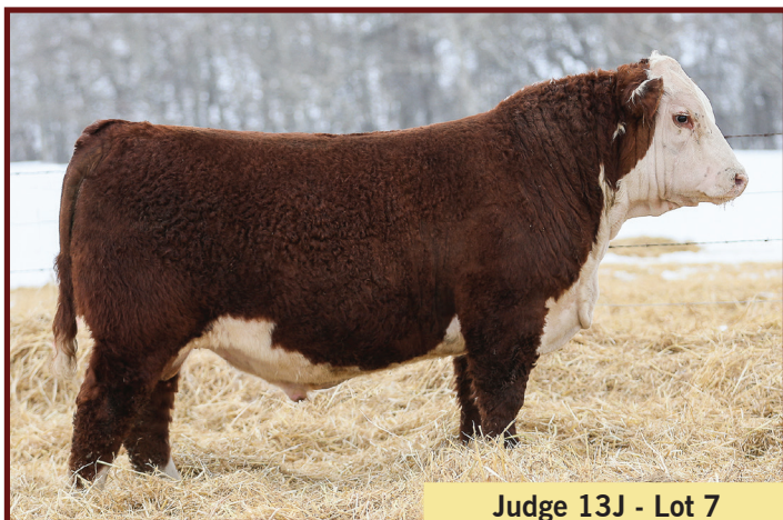
Judge 13J - Lot 7

Here is a nice moderate birth weight Royal son with some extra pigment, lots of power and maternal strength in this pedigree.