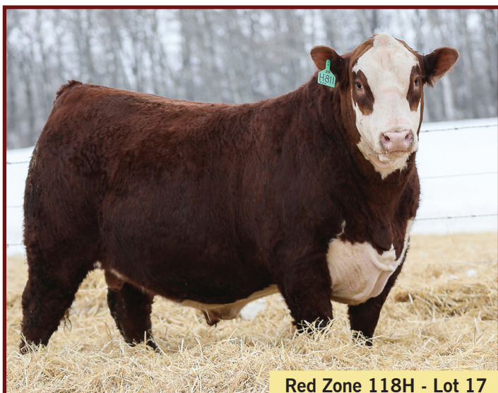
Red Zone 118H - Lot 17

Here is a well-balanced freckle faced Insight son. He is easy doing and out of a really nice young Marvel female.