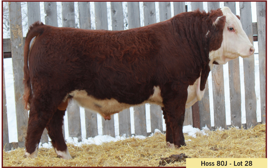
Hoss 80J - Lot 28

Lots of performance and length here. Maybe one of the most impressive structured bulls in our group. 80J's dam, 101D, is headed for the Donor pen this spring. When I say this cow is perfect uddered, I'm hardly doing it justice, she's worth coming to look at. First son sold to Ramsay's from Sinclair Manitoba. 80J and his maternal brother 107H were both at Agribition in November, where 107H was Reserve Junior Champion. Put this guy with the cows and expect some extra pounds at weaning time.