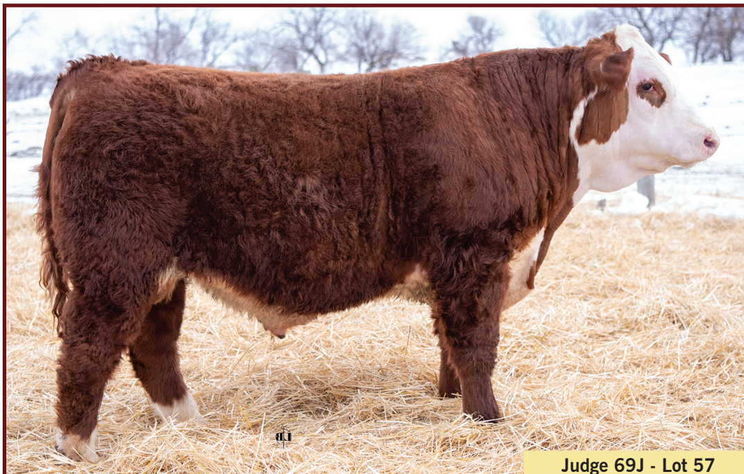
Judge 69J - Lot 57