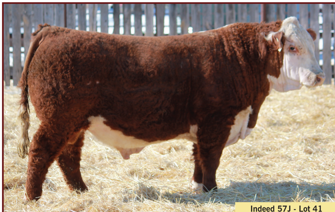
Indeed 57J - Lot 41