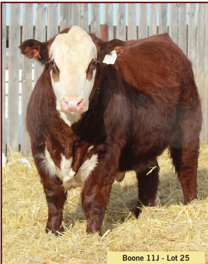
Boone 11J - Lot 25

MCCOY 55M ABSOLUTE 49S GHR SEBASTIAN 3S 26W GHC VOLUME IV ET 150S GHR NANCY 54L 11N