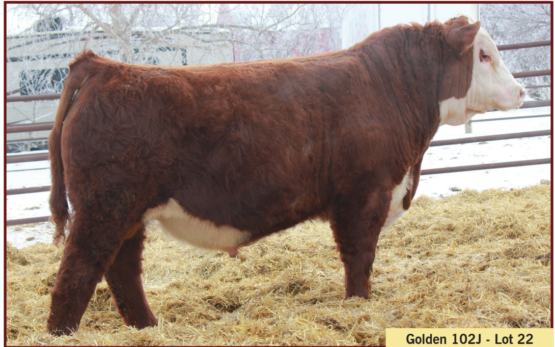
Golden 102J - Lot 22