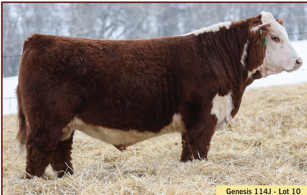
Genesis 114J - Lot 10

If you are looking for some fresh genetics take a look at this guy. He is a half-brother to the $245,000 Media bull, who made quite a stir last fall. Take note that this is just an April bull. He is big bodied and stout made with excellent testicular development for his age.