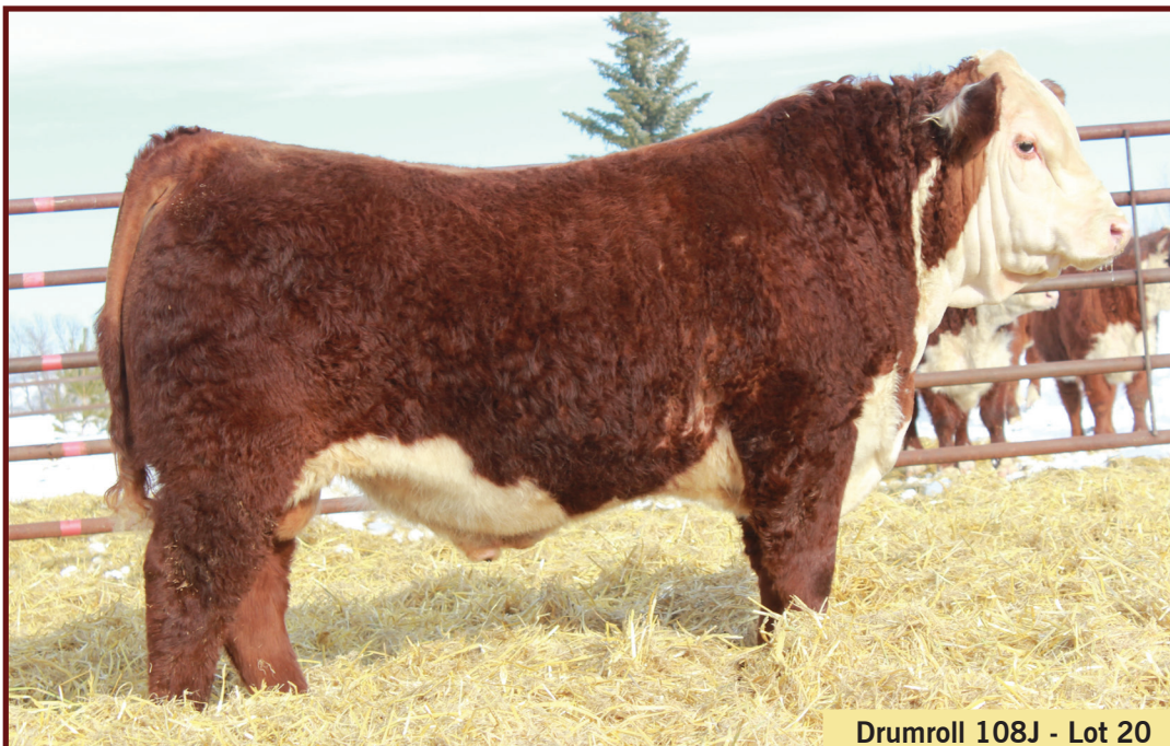
Drumroll 108J - Lot 20

Drumroll 108J is long sided and stout with style to burn. His Dam, 102F, is out of the Heidi cow family, one of the best ever at Blair Athol. 108J stood in our Agribition string last fall for a good reason!