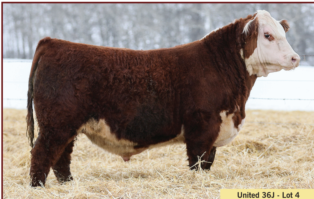
United 36J - Lot 4

Another United son with that added middle and spring of rib. This bull is long sided and stout made. His mother has been an excellent producer and is still going strong.