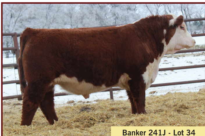
Banker 241J - Lot 34