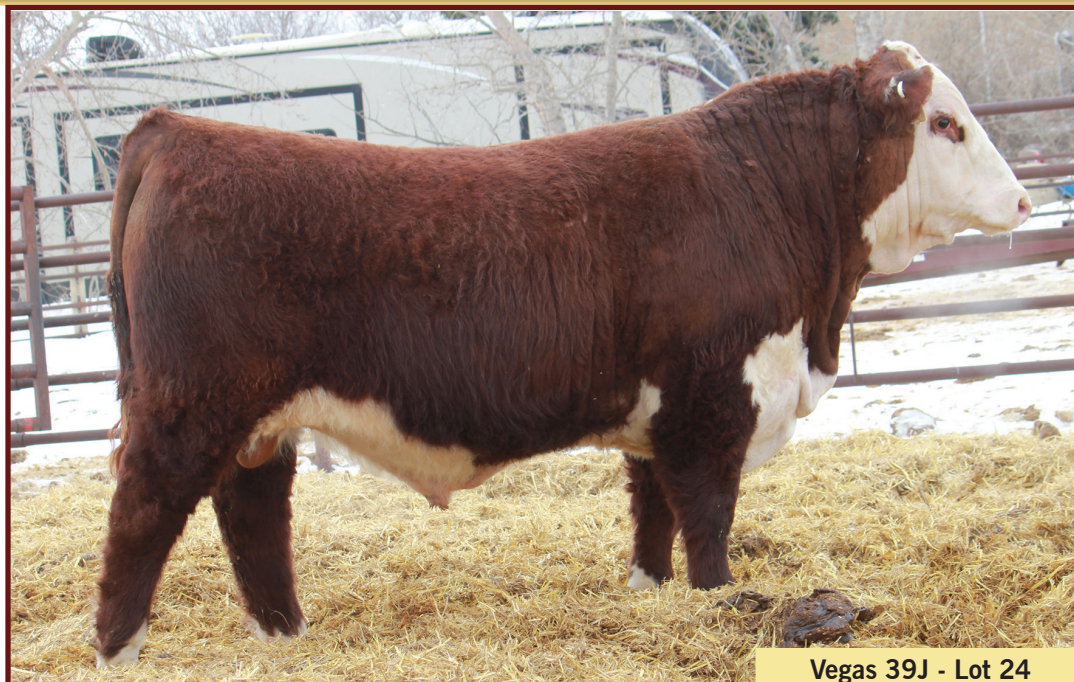
Vegas 39J - Lot 24