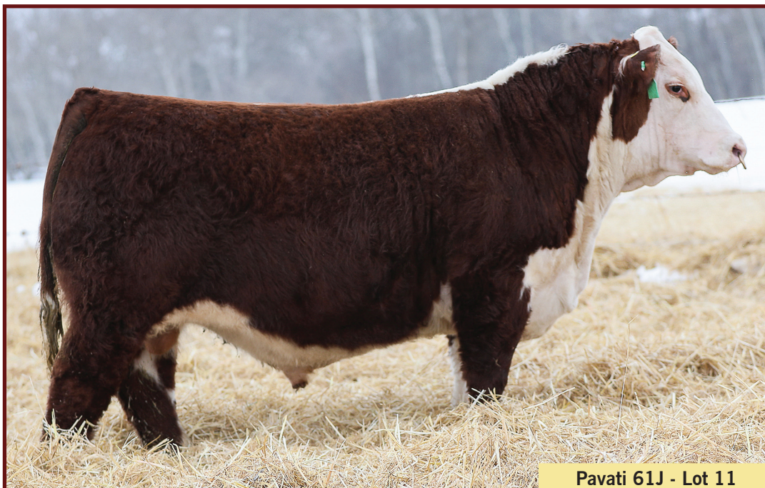
Pavati 61J - Lot 11

SHF TAHOE R117 T100 HAROLDSON'S 37H MIRA ET 62K NJW FHF 9710 TANK 45P REMITALL MARVEL 190S