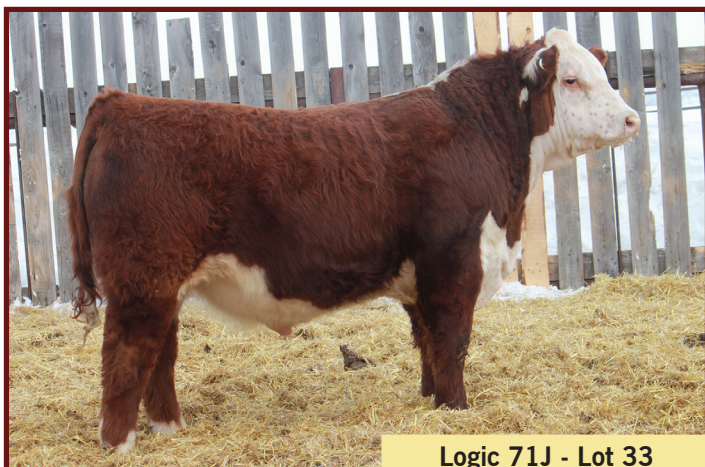
Logic 71J - Lot 33