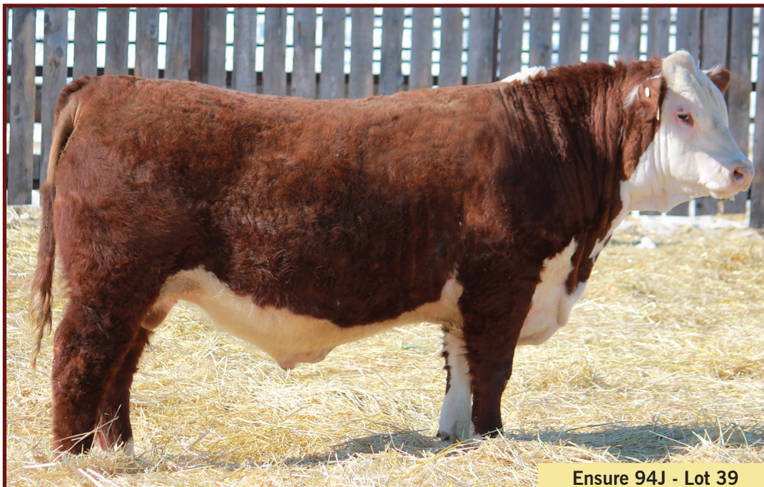
Ensure 94J - Lot 39