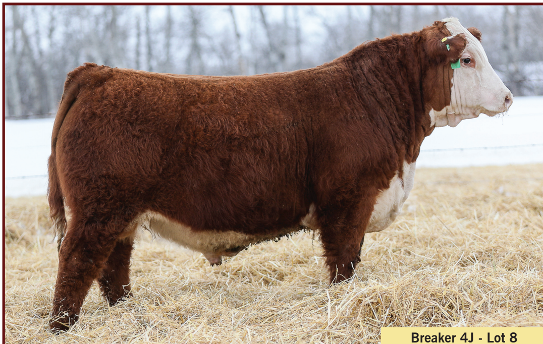
Breaker 4J - Lot 8

I really like this Pilgrim son. He has a lot of shape down his top and is explosive in his hip and stifle. He is very correct in his structure and is very sound made. There are a lot of productive cows in this pedigree.