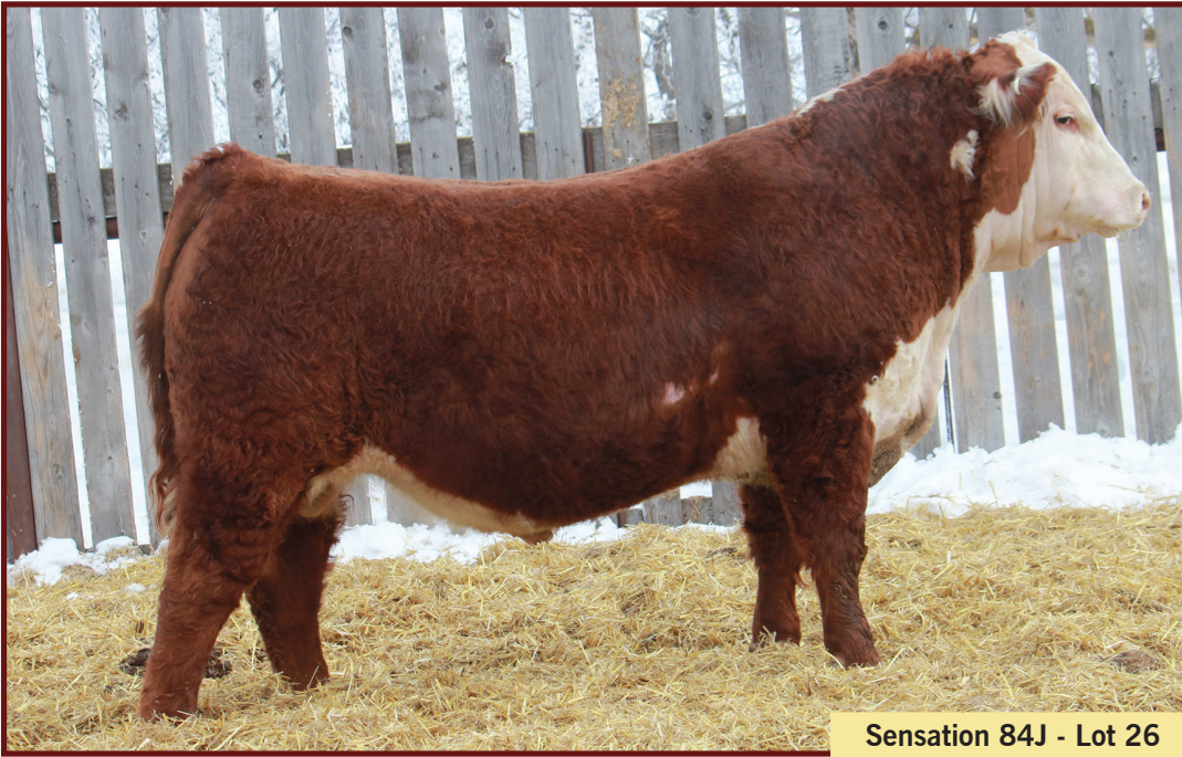
Sensation 84J - Lot 26