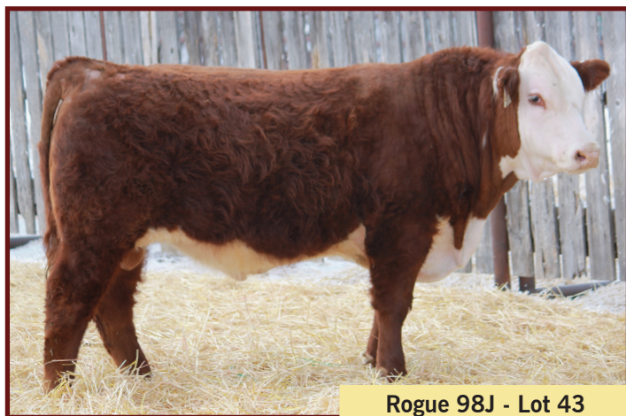
Rogue 98J - Lot 43