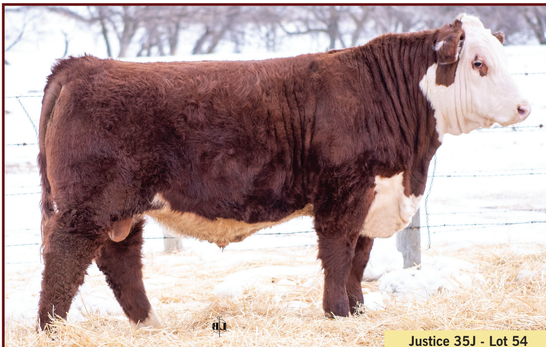
Justice 35J - Lot 54

REMITALL SUPER DUTY 42S SQUARE-D NADIA 323P SQUARE-D REPORT 593R SQUARE-D SERENA 295U