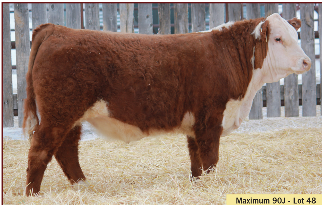
Maximum 90J - Lot 48