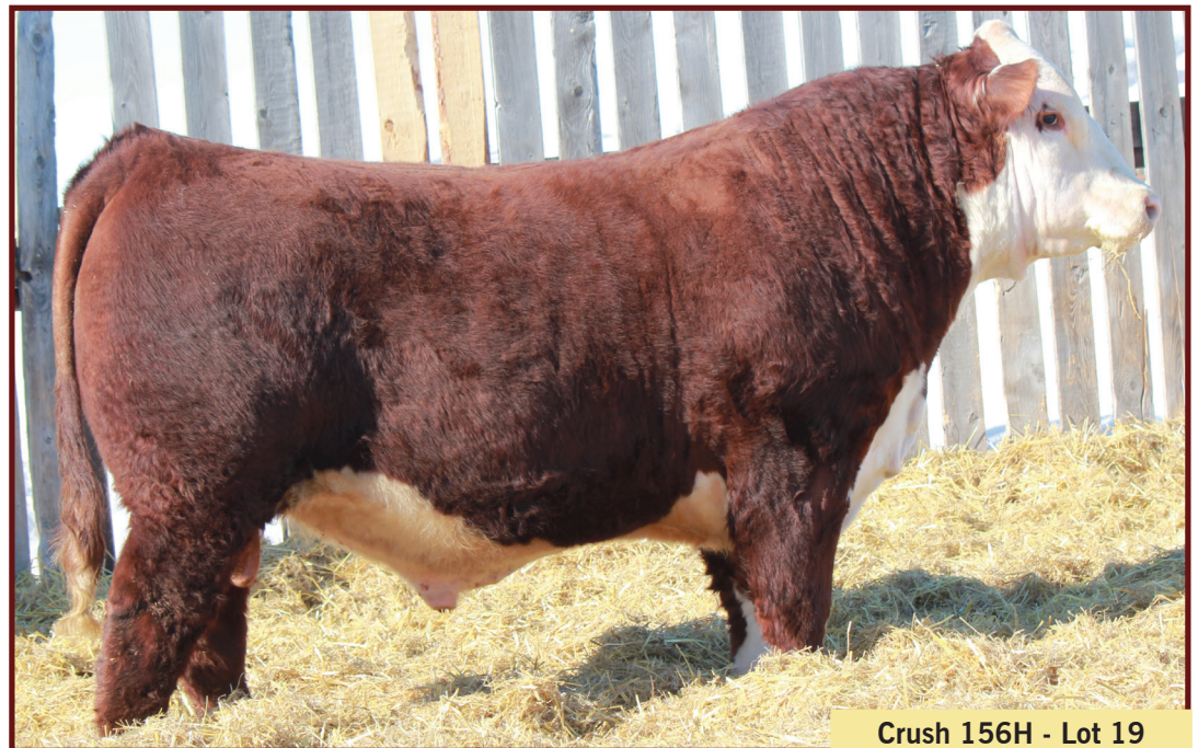
Crush 156H - Lot 19