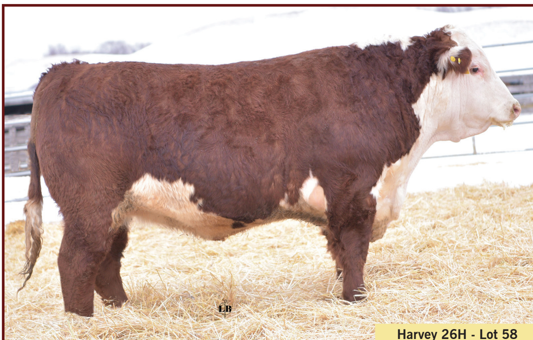
Harvey 26H - Lot 58

MHPH 101S UMPIRE 118U GHC-TABOO-TCF MISS KAREN 4T ANL 37H HARD COPY 51K C&T JANA 26D