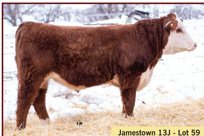
Jamestown 13J - Lot 59